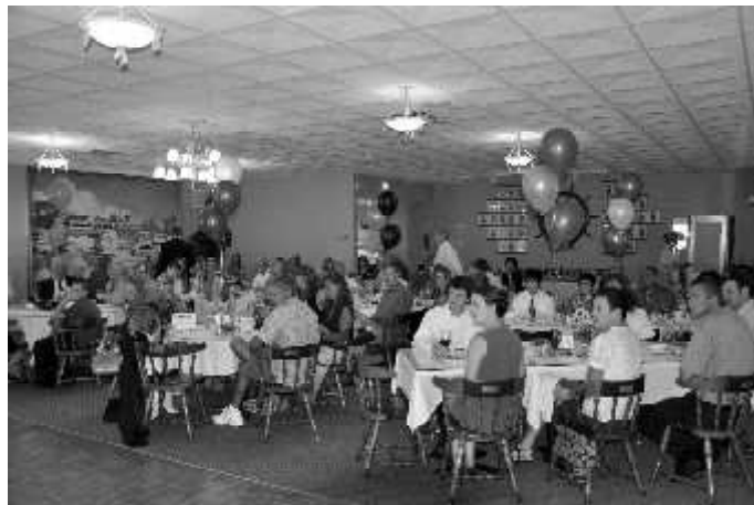
Scholarship recipients, their counselors and families enjoy the dinner as part of the awards festivities, with tables adorned in balloons in their respective schools' colors.